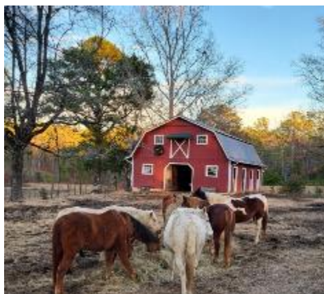
Main herd has 8 horses, total equines 16

Progress & Plans about animals & programs for partners, students, and nonprofits.