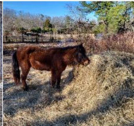
July still able to walk after 2+ years