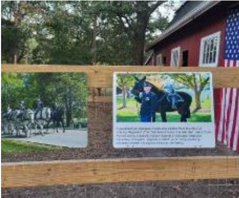
New metal signs

To donors, volunteers, advocates, other friends--progress, plans, possibilities—October 28, 2023