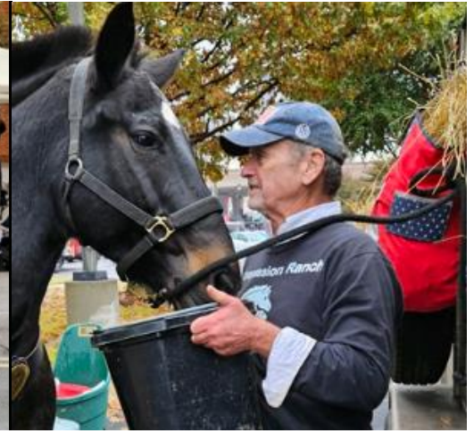
Handlers before the parade.