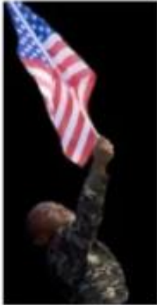
Boy at Veterans Day Parade Birmingham

Our Pledge of Allegiance to the Flag of the United States of America was written in 1892 by Francis Bellamy. The American Legion and Daughters of the American Revolution recommended changes in the 1920s, and the Pledge has been revised with the last change coming on Flag Day 1954 when Congress passed legislation adding the words "under God." President Eisenhower signed the Pledge and Veterans Day into law in 1954.