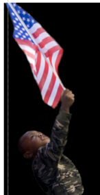
Boy at Veterans Day Parade Birmingham

Our Pledge of Allegiance to the Flag of the United States of America was written in 1892 by Francis Bellamy. The American Legion and Daughters of the American Revolution recommended changes in the 1920s, and the Pledge has been revised with the last change coming on Flag Day 1954 when Congress passed legislation adding the words "under God." President Eisenhower signed the Pledge and Veterans Day into law in 1954.