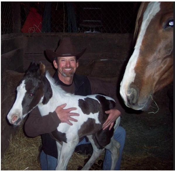
<=Indy Day 1.

Yet, the seeds of this calling started in 2008 with the birth of Indy and earlier during the pregnancy of his mare. When the owners learned Indy's mare was pregnant, they ignored her. A feeling stirred inside me that I needed to at least give her TLC and took over feeding. Blessing: the morning Indy was born, his mare invited me into the stall like family. I was Indy's first human and we have been instinctively close since. The owner of Indy did not want him so I paid for him to join Patriot and Star.