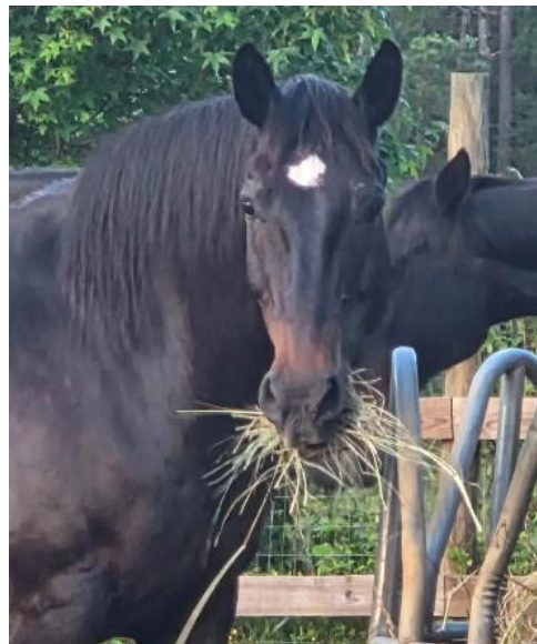
Hank the Tank loves his hay.