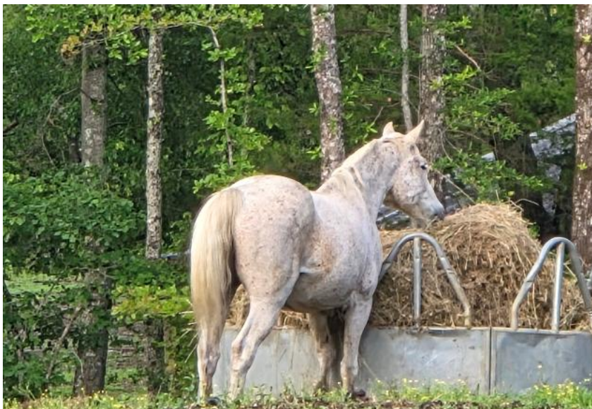
Lancelot was rescued from starvation by deputies 6 years ago.