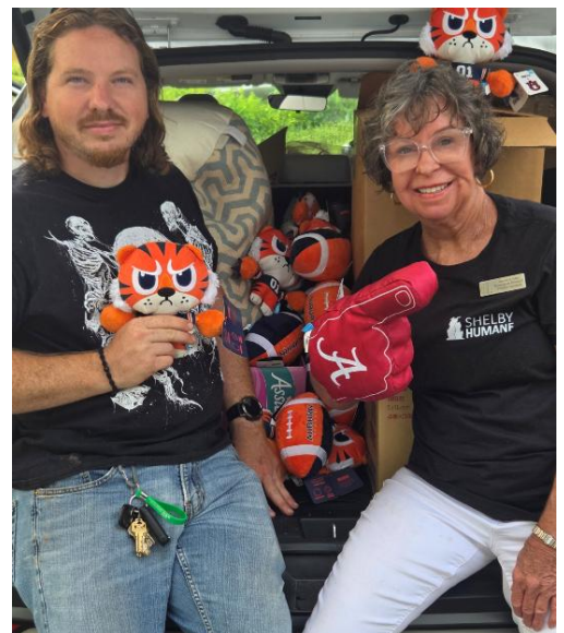
Donations to Shelby Humane Society.