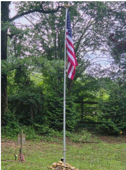
Barefield Flagpole got a new flag.

Pages 1-3 Photos / 3-7 Progress-People-Plans-Possibilities