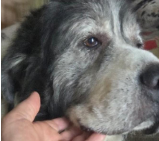
Teddy, our most senior dog, is still with us, enjoying life a little more often from inside.