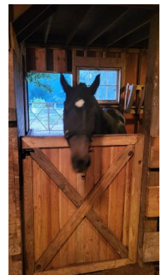
Hank in his new stall and pen.